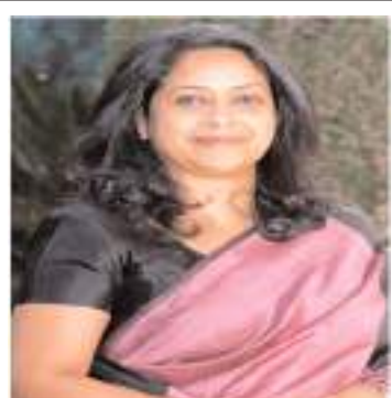
By Ms. Sharmishtha Mukherjee

Amid the raging debates about the longest serving Prime Minister in India, I remember an interesting insight shared by my father late Pranab Mukherjee about Prime Minister Narendra Modi's landslide victory in 2014. Baba was then the 13th President of India. Despite belonging to different political ideologies, they shared an excellent rapport that perhaps is the hallmark of a true democracy.